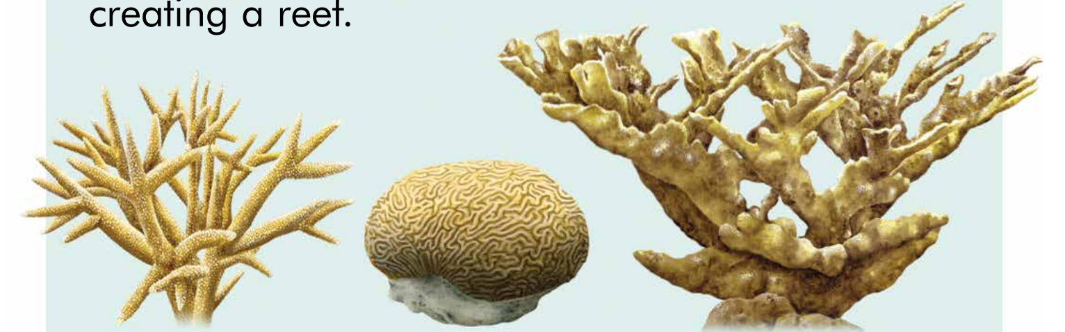
Staghorn coral Acropora cervicornis

Corals are tiny animals related to sea anemones and jellyfish. Individual animals, known as polyps, live in colonies that make up a coral head. As polyps live and die their stony skeletons slowly contribute to the growth of the coral heads, creating a reef.